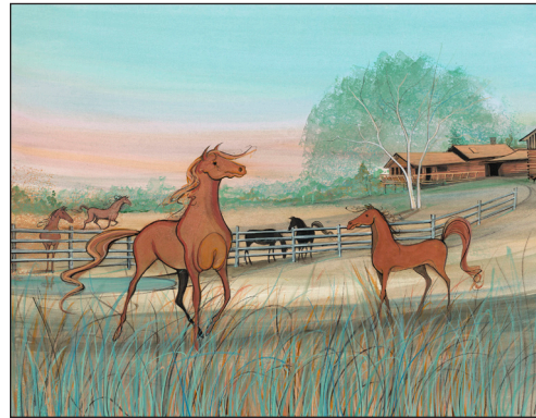
Greener Pastures A fundraising print for Casey's Place Animal Sanctuary, Inc., in Brooksville, FL, and other horse rescue organizations.

Plus your image will be shown with pride in the homes and offices of your supporters, providing a great talking point for friends and business associates.