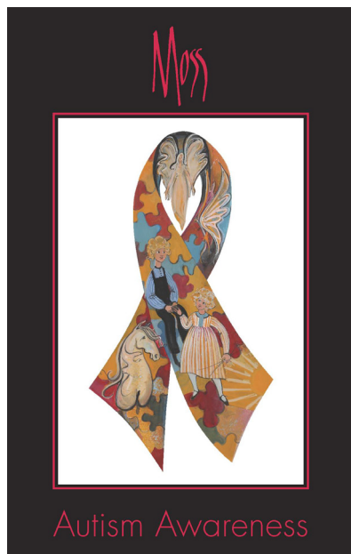
Autism Awareness Poster Posters can also be used for fundraising.

After this initial contact, we will explore with you subject matter and schedules prior to framing an agreement.