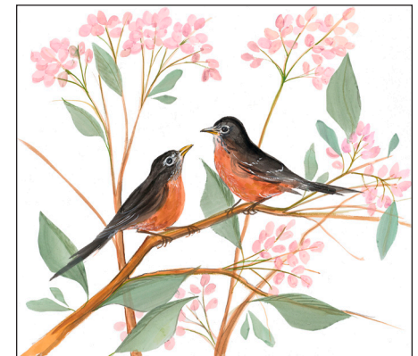
Spring in Connecticut A fundraising print for Connecticut Public Television